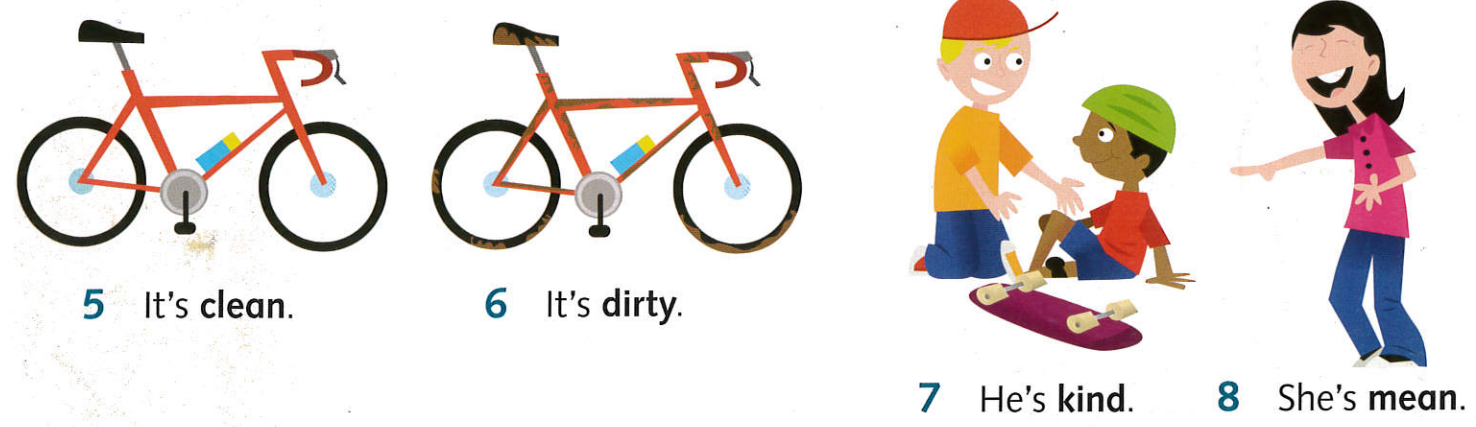
5 It's clean. 6 It's dirty. 7 He's kind. 8 She's mean.

2 Match the words. Then say with a friend.