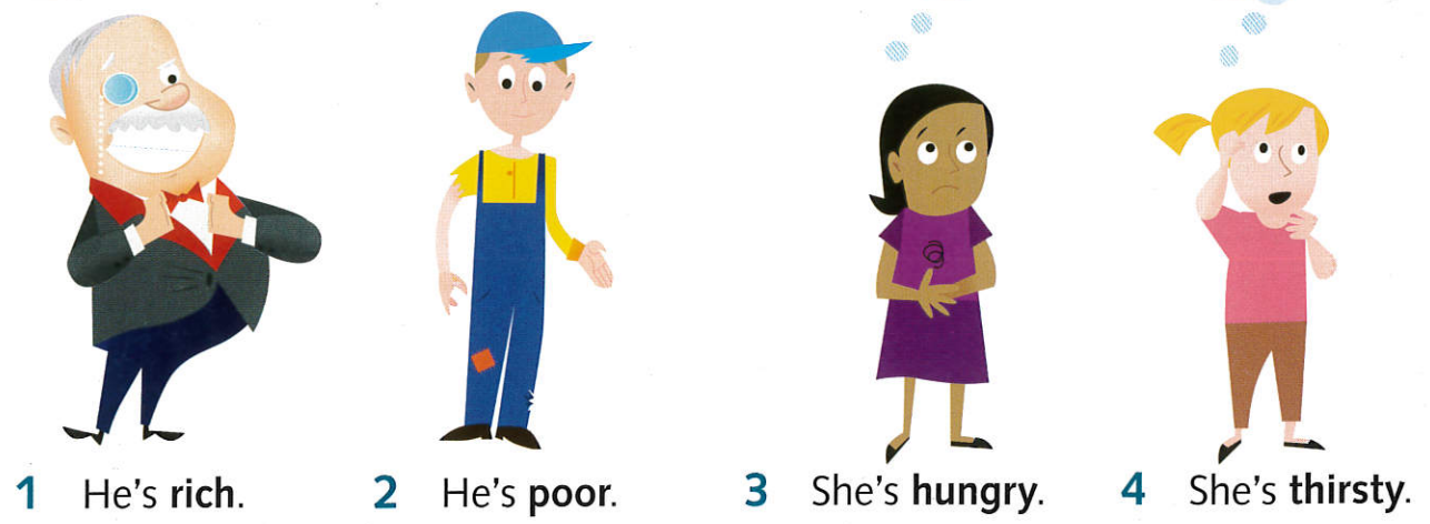
1 He's rich. 2 He's poor. 3 She's hungry. 4 She's thirsty.