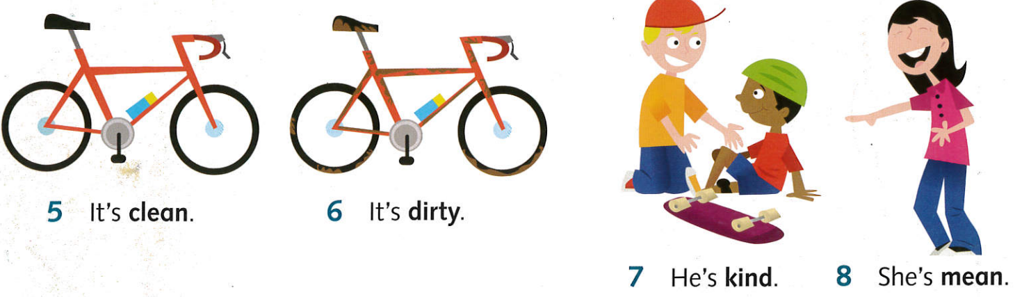
5 It's clean. 6 It's dirty. 7 He's kind. 8 She's mean.

2 Match the words. Then say with a friend.